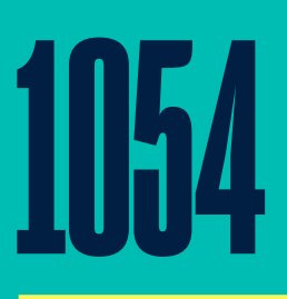
1054 New free users accounts 148% growth

Within the course of the Expanded project, VUCAVU hosted 55 programs.